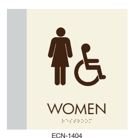
7 625 X 7 625 WOMEN HANDICAP RESTROOM